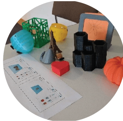
3D Printing Class