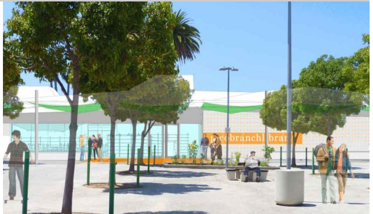
View of the Pico Branch Library from the Farmers Market Rendering by Koning Eizenberg Architecture

The library has a two-building design. The main, 7,872 square-foot facility consists of adult, teen, children's and Spanish-language collections; popular materials; a children's area; group study rooms; reading areas; public computers; and customer support services. To the west, across a fire lane, is The Annex, a separate 818 square-foot community room, that will be used for story times, educational, and cultural programs. The structures are connected at the roofline with a trellis, creating a pedestrian breezeway. A small, exterior amphitheater with terraced steps on the community room's south face enhances the building's relationship to the Park Center and the Teen Center. The community room also has the advantage of being able to function independently of regular library hours and can be rented by the public.