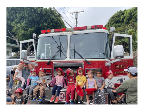
Special guests from Fire Station No. 4 came and brought their fire engine for community members to take a peek inside and take pictures before they had to leave to respond to an emergency call.

Walk-in Tutoring – An Essential Service at the Library: It has been one year since library staff brought back Walk-in Tutoring through its regular programs "Appy Hour" and "Tech & Tasks". Both programs focus on assisting individuals with myriad questions, from devices to writing help to job and resume questions. People can "drop-in" and connect to a tutor. Since its launch last September, we have had 428 documented sessions.