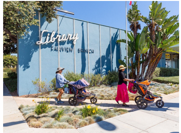
(Self-service via Open+)