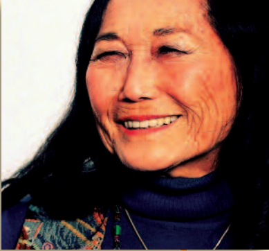
– Jeanne Wakatsuki Houston, Farewell to Manzanar

"I was suddenly aware of what being of Japanese ancestry was going to be like. I would be seen as someone foreign, or as someone other than American, or perhaps not be seen at all."